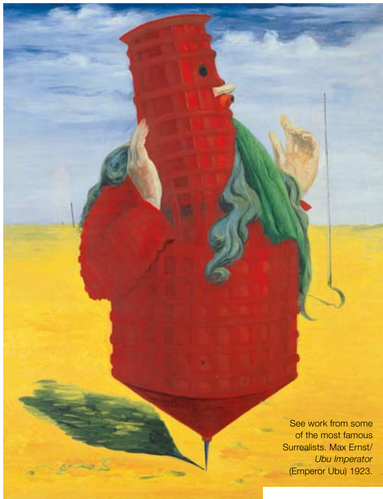
See work from some of the most famous Surrealists. Max Ernst/ Ubu Emperor (Emperor Ubu) 1923.

A breathtaking exhibition of Surrealist works from the Centre Pompidou in Paris is showing exclusively at Brisbane's Gallery of Modern Art until 2 October, 2011. With more than 180 works by 56 artists such as Salvador Dalí, René Clair, René Magritte, Joan Miró and Man Ray, the exhibition presents a historical overview of Surrealism, including paintings, sculptures, films, photographs, "Surrealist objects", drawings and collages. Don't miss this rare opportunity to see some of the finest Surrealist art, which rarely leaves Paris. Up Late returns to the Gallery of Modern Art every Friday night until 30 September, offering you a unique opportunity to enjoy the exhibition, including talks and music, after hours. Read on for your chance to win VIP tickets to this amazing event.