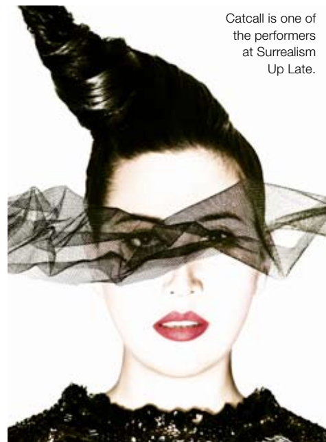
Catcall is one of the performers at Surrealism Up Late.

For your chance to win this incredible experience, visit vogue.com.au and explain in 25 words or less: why do you want to visit GoMA and see Surrealism: The Poetry of Dreams ?