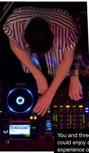
You and three friends could enjoy a VIP experience of the GoMA and Vogue Surrealism Up Late event.

Competition starts XX/XX/2011 00:01 AEST and ends XX/XX/2011 23:59 AEST. Winners judged XX/XX/2011 at 2:00pm AEST. This is a game of skill and chance plays no part in determining the winner. Promoter News Magazines PTY LTD 180 Bourke Road Alexandria, NSW 2015. ABN: 57 088 923 906. For full terms and conditions go to: www.newsmagazines.com.au/terms